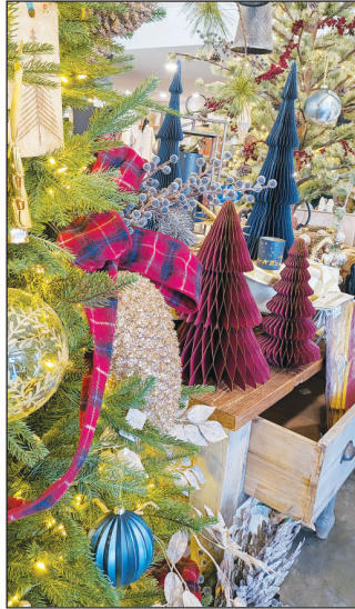
St. Edward Floral provides floral arrangements for funerals, weddings, and other occasions. They also offer various gift and décor items.

Community Builders helps individuals in Platte, Colfax, Boone, and Nance counties learn ways to improve their communities. Sponsors are Cornhusker Public Power District, Loup Power District, and Central Community College.