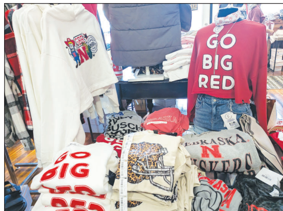
A selection of Nebraska clothing items located at Sal's Shoppe. The shop also offers a variety of clothing items, gifts and jewelry.