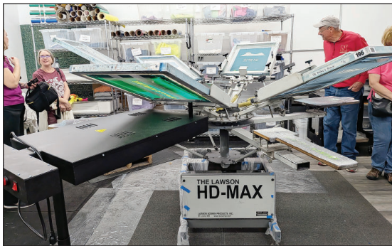
307 Designs uses a manual screen printer to make various apparel items. The printer is set up to use six different colors.