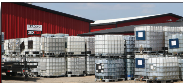
Chemicals ready for transport sit at the main office in Leigh.